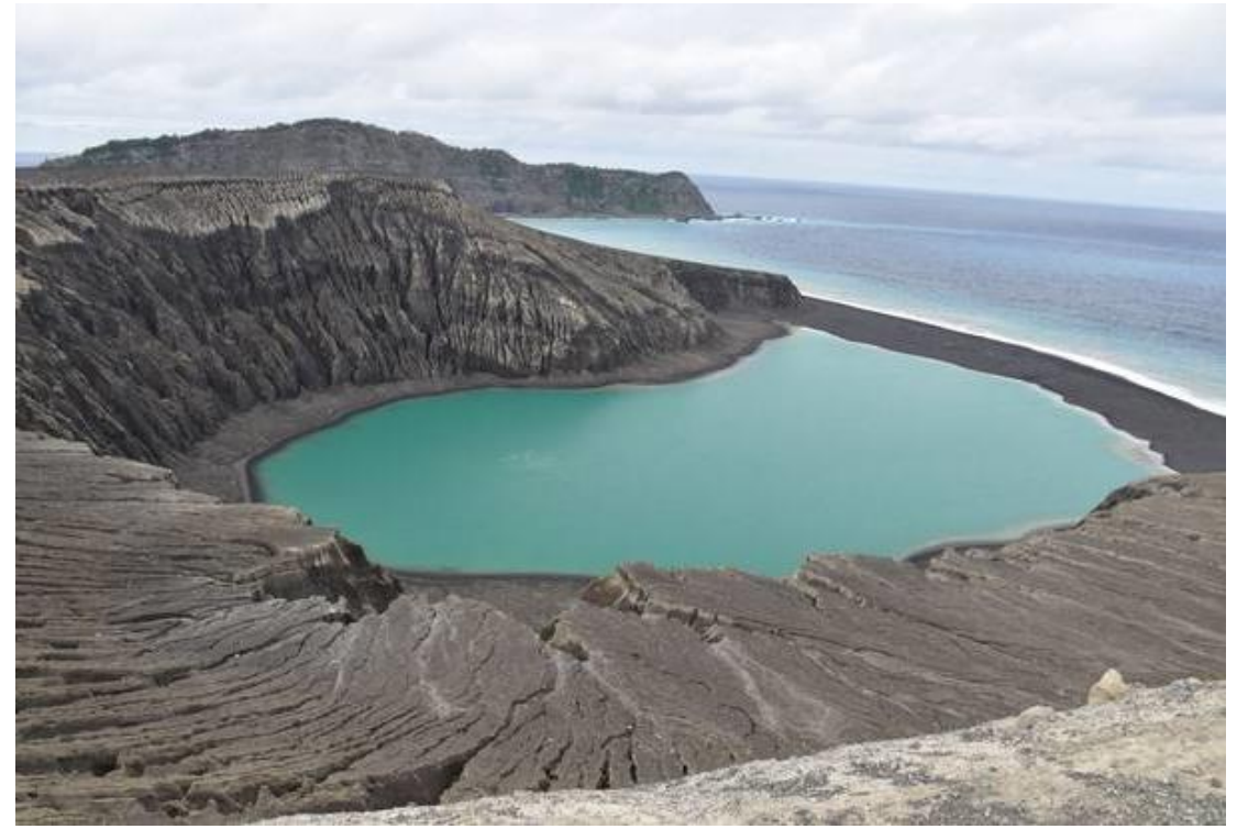
Hunga Tonga- Hunga Ha'apai