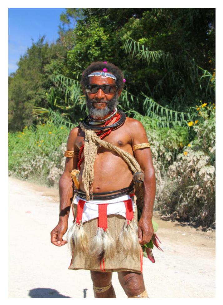
Lukim yu bihain (see you later!)

Our resources as expected were limited but adequate. My experience in Nyakibale was fascinating, at times tragic but mostly incredibly gratifying and I would encourage all emergency trainees to join in the effort of providing this universal right of basic healthcare for all.