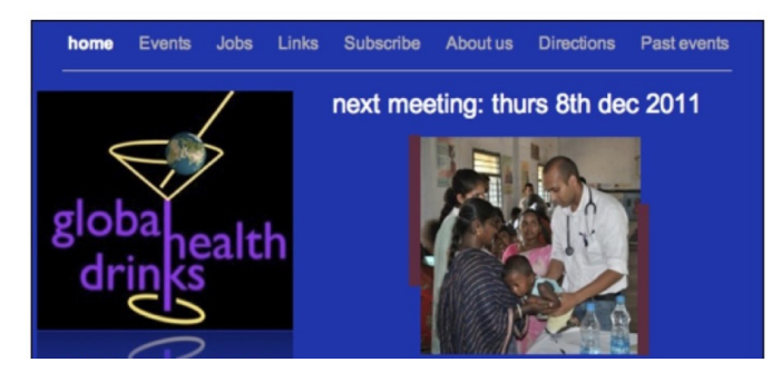
Local "Meet ups" – Global Health Drinks www.globalhealthdrinks.org

development of EM. EPi has over 1,300 members from 60 countries and has at least 10 special interest groups, eg "Emergency Medicine India", "Nordic EM" or "Wilderness Austere Medicine". There is also an online magazine, currently in its 6th issue, containing articles contributing towards a theme, eg EM in Asia, in Issue #4.