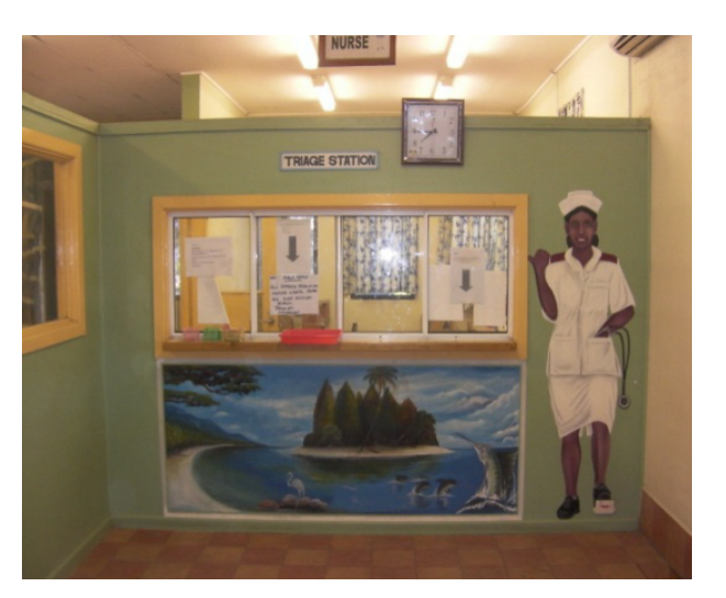
The new triage station at Honiara.

Future improvements lie with organising short courses for registrars (EMST, ELS, APLS), rolling out more PTC courses in the country, and with the first qualified emergency physician expected in 2012. There is a need also to upgrade the current equipment, ambulance service, communication network, Kilu'ufi & Gizo EDs, and to establish a mass casualty plan.