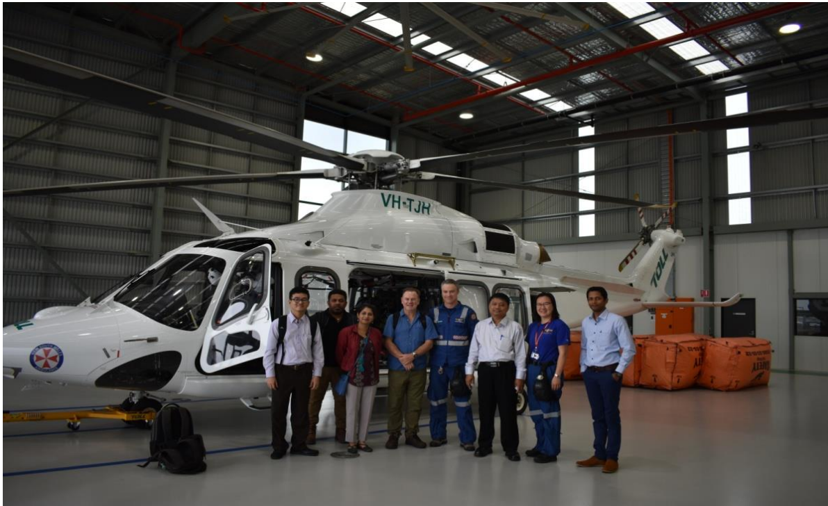
Aeromedical Crewing Excellence (ACE) Training Centre at Bankstown The simulation centre at Royal North Shore Hospital was observed on the same day and had a great opportunity to learn about how the ED teams practice in high fidelity mannequins.