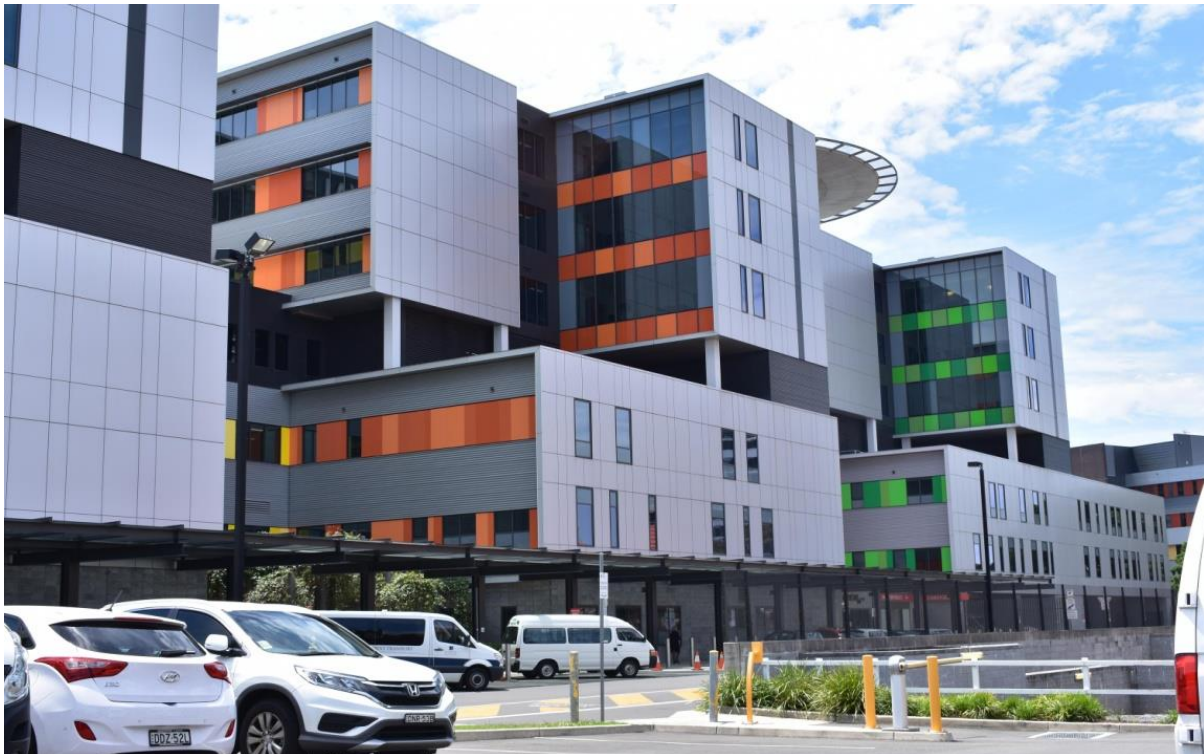
RNS Hospital, Sydney