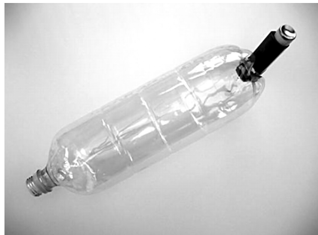
Image reproduced from British Medical Journal. Woollard M, Greaves I4 Shortness of breath Emergency Medicine Journal 2004;21:341-350

If spacers are not available, they can be made locally with a clean plastic bottle and dispensed for single patient use. Consider using ancillary staff or community volunteers to make lots of these.