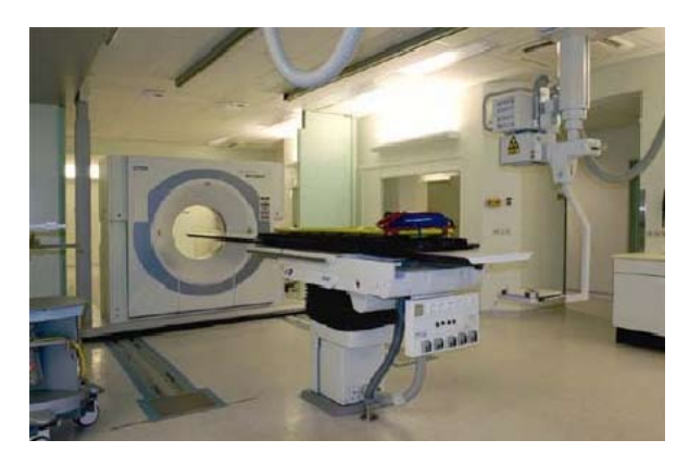
AMC Trauma Room

of its new SEH which is large, well lit and purpose designed though unfortunately with some major design flaws. In particular there is no procedure room and the two small enclosed "shock rooms" (resuscitation rooms) are separated from the main body of the department by a 30 metre corridor lined with offices. As is the case throughout the country there is no Observation Unit.