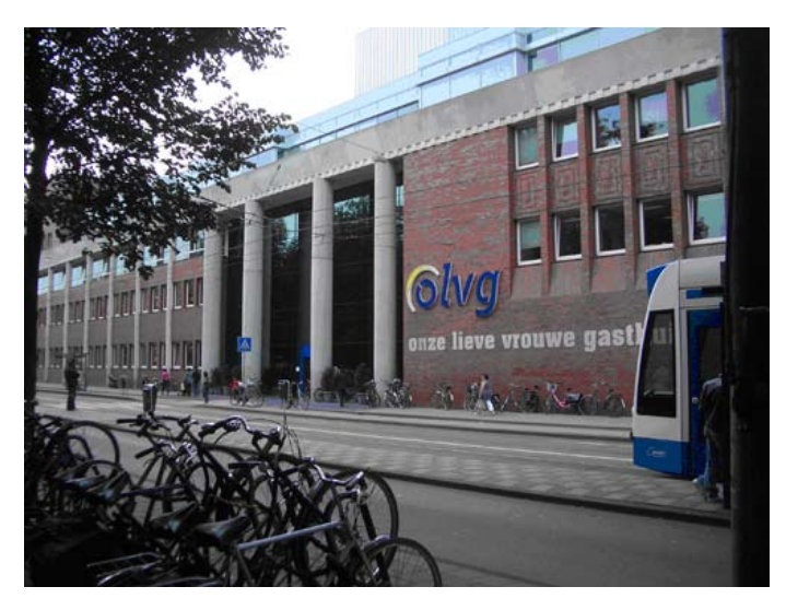
Onze Lieve Vrouw Gasthius (OLVG), Amsterdam

Fragmenting undifferentiated acute problems into presumed diagnostic streams prior to hospital undermines the whole principle and raison d'etre