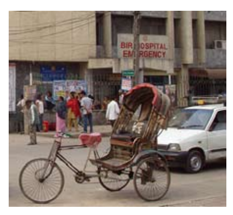
Bir Hospital ED Entrance

at the Nepal Medical Association Annual Meeting held in April 2009 and I extended contacts then.