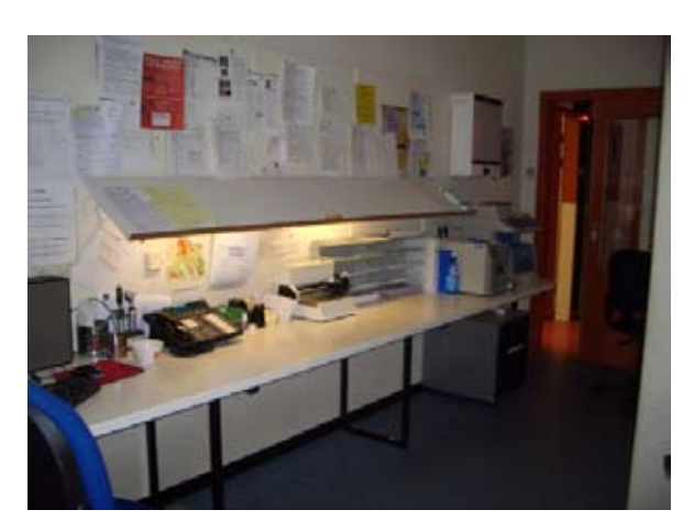
AMC ED Doctors' Work Area

A couple of hospitals have built new SEH facilities – in particular OLVG in Amsterdam is rightly proud