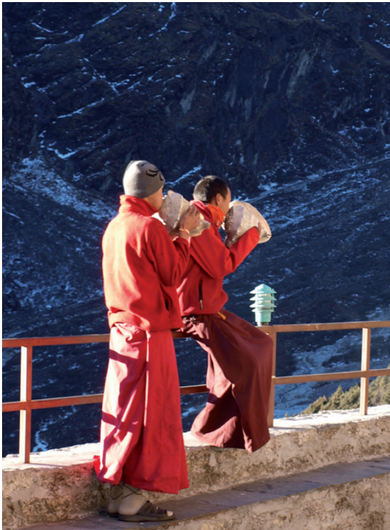
A call for emergency care in Nepal

In India - the Medical Council of India (MCI) recognized emergency medicine as a specialty in 2009. There is now activity to have emergency medicine training programmes approved by the MCI so that the training of specialists can get under way.