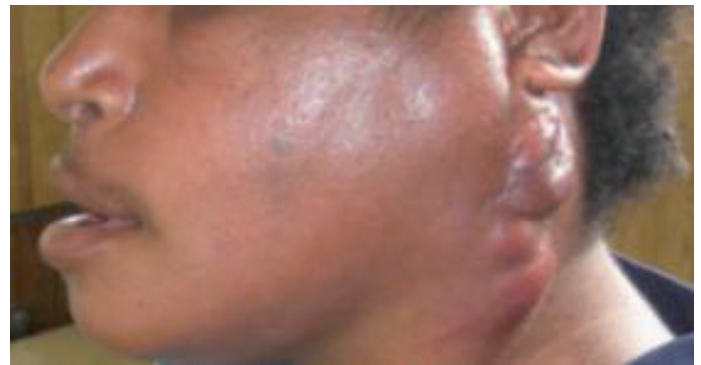
An extensive parotid tumor