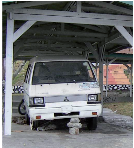
The broken down ambulance at Luwuk Hospital

Sulawesi is an amazing place with spectacular natural beauty and diverse cultures. Anyone interested in any further details can contact me at: ameerakhan@hotmail.com