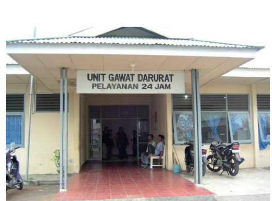
The entrance to Luwuk Hospital