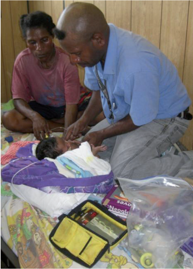
An unwell child receiving physiotherapy