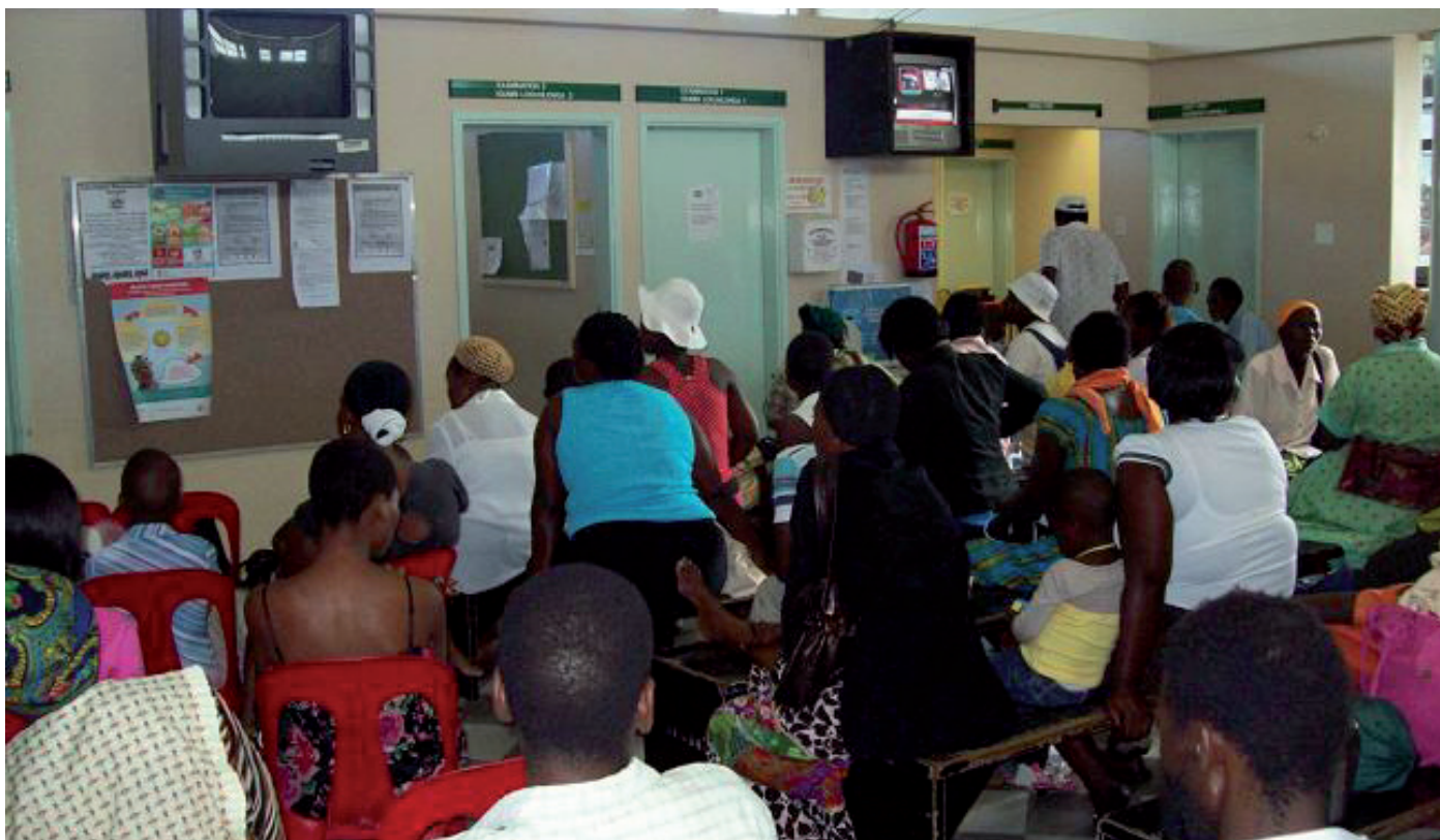
...while OPD waits

the hospital, to at least give him some symptomatic relief.