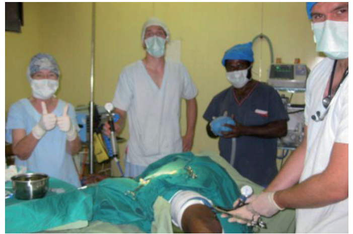
Surgical tourniquet in use