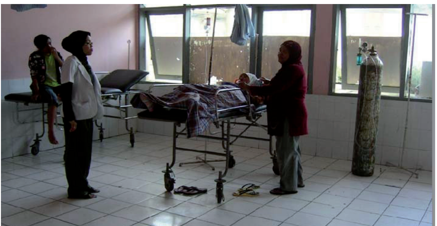
The emergency room at Luwuk Hospital