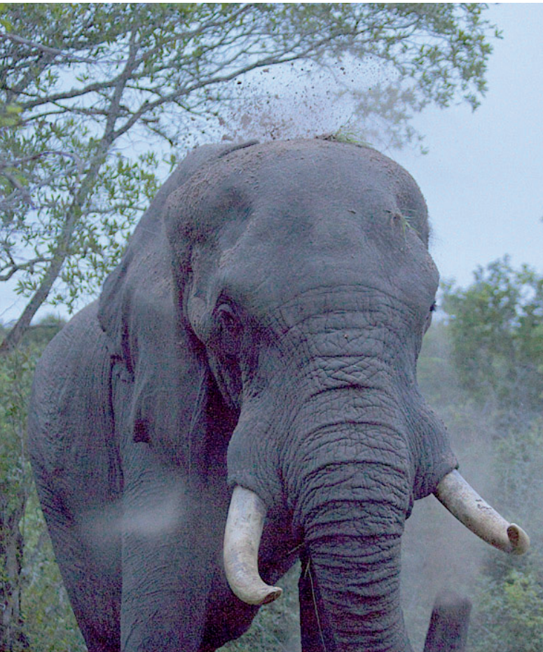
Dusting off after a long day

An enthusiastic junior RN and EN helped out, while the night matron did paperwork in the office!