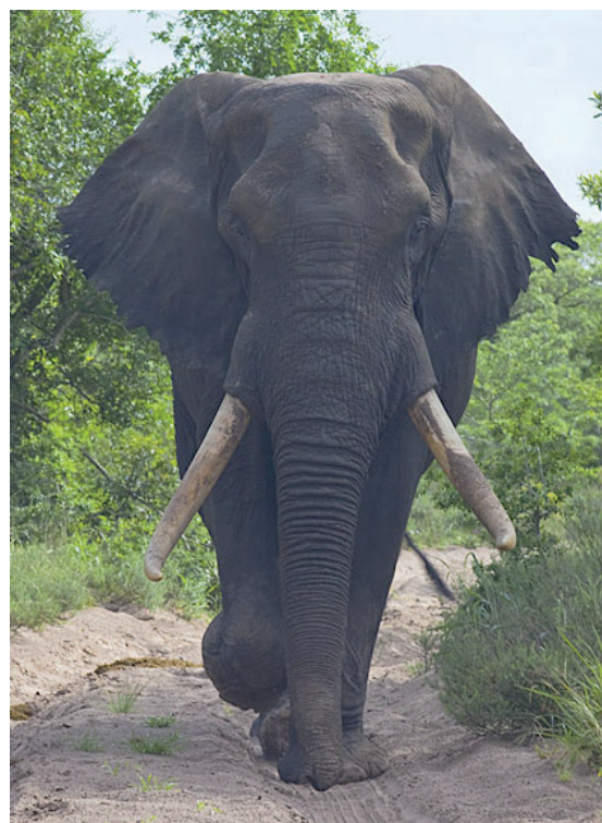
Getting on with it

Even after nine months in a small hospital, working with a team of doctors is still what is most comfortable. How to manage this guy all by myself? So I fell back on ABC.