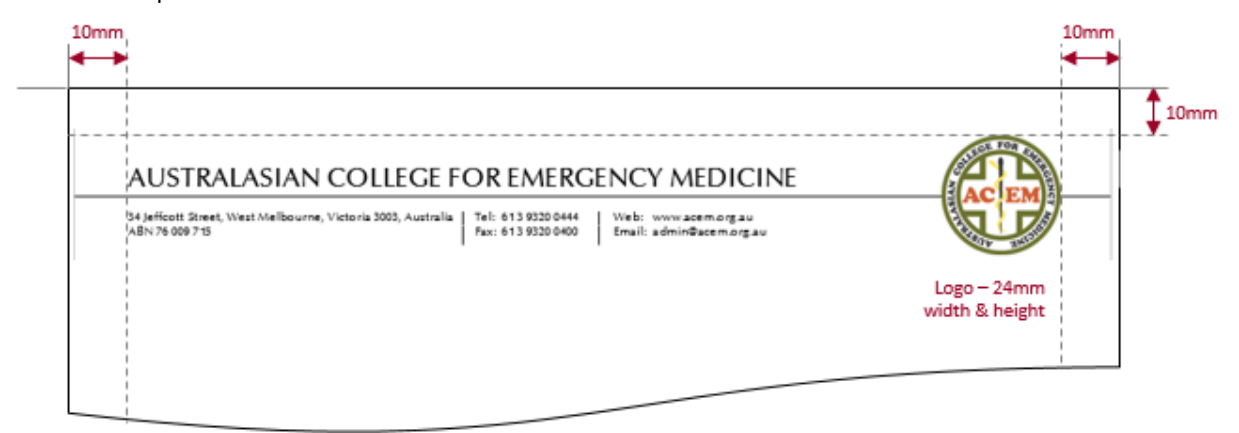
Figure 6 – Letterhead layout